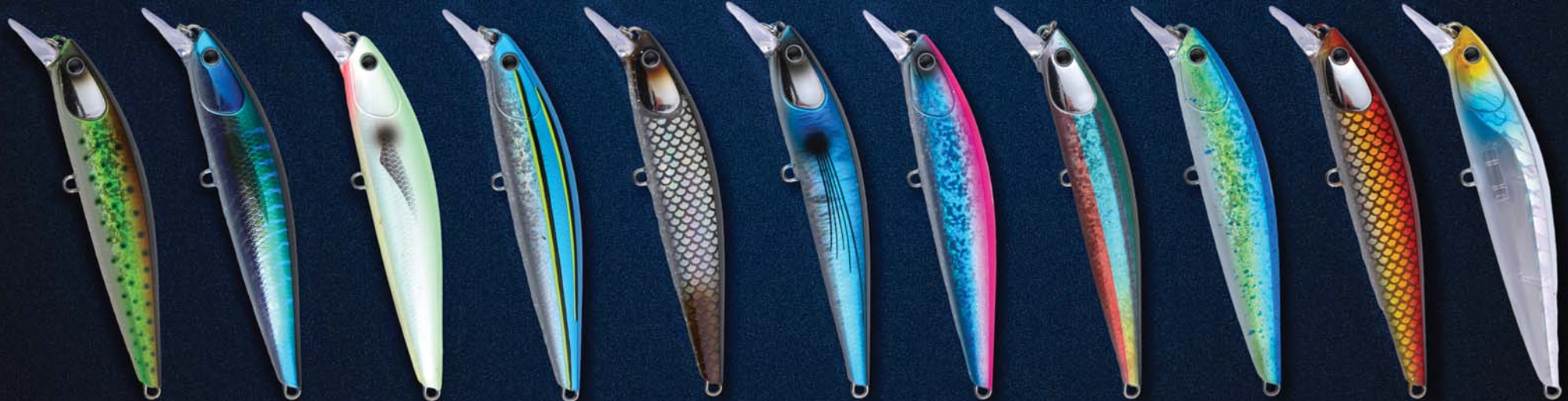
NUCLEAR LUMO MACKEREL

COLOUR RANGE FEATURES 11 LIFE LIKE STYLE COLOURS FEATURING UV-REACTIVE PAINT, INCLUDING GLOW PROPERTIES ON SELECT MODELS. HIGH QUALITY JAPANESE 3D FOIL AND FLUTTER WITH A MULTILAYER TOUGH COATING TO COMPLETE THE FINISH.