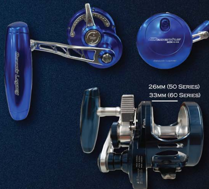
26MM (50 SERIES) 33MM (60 SERIES)