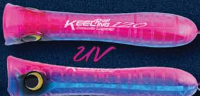
#07 BLUE PINK SILVER