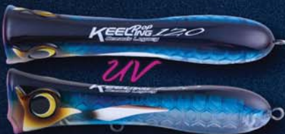
#06 PACIFIC FLYING FISH