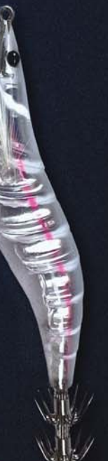
#1 GREEN GOLD UV Glow