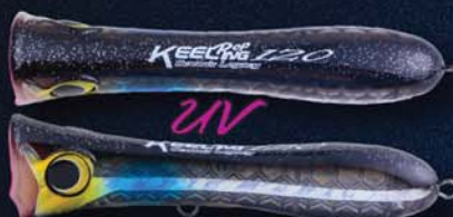
#05 SILVER MULLET