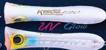
#08 CRYSTAL LUMO ANCHOVY